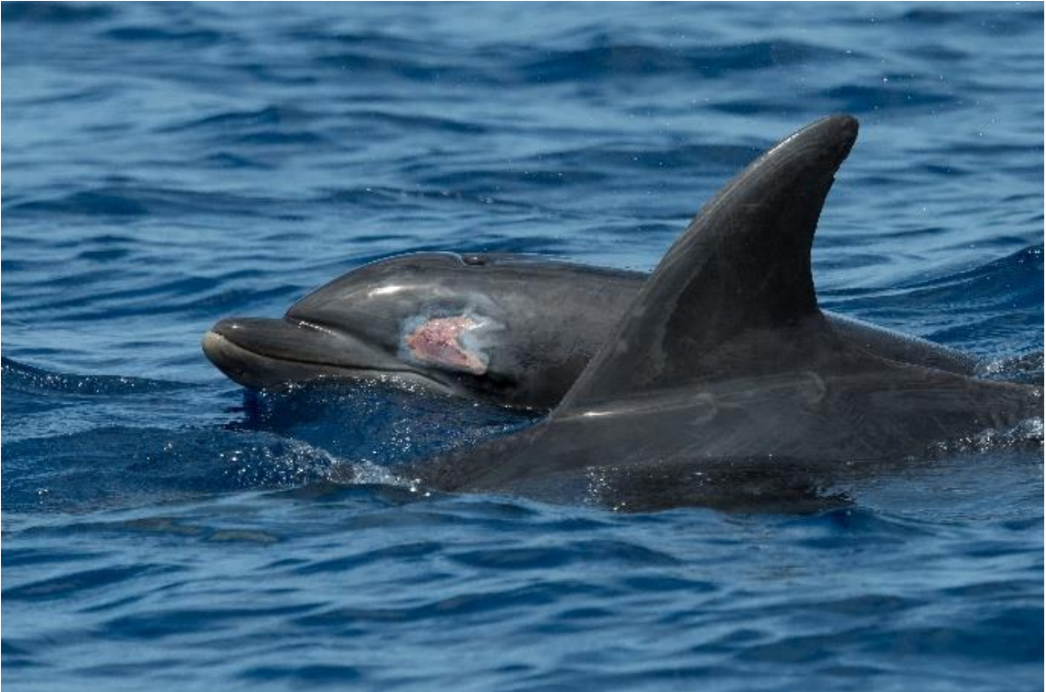
Figure 1. Photographs of a bottlenose dolphin calf HITt1093 with gunshot wound visible on the right (top) and left (bottom) sides of the melon 14 July 2018. The accompanying adult is likely the mother based on close proximity during all encounters of the calf.