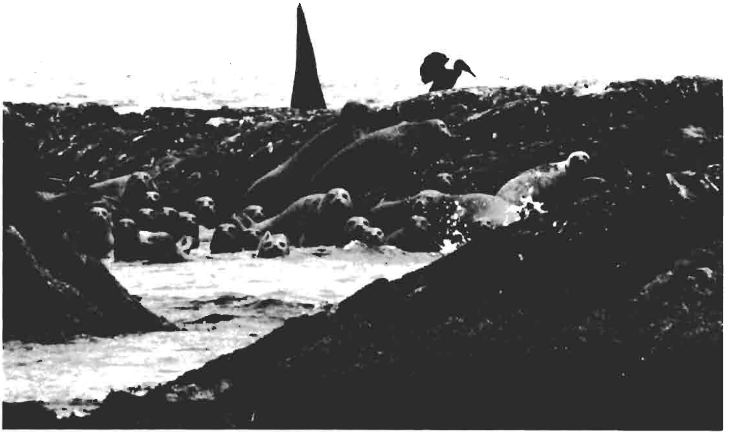
Transient Y1 with harbor seals at the Oak Bay Islets Ecological Reserve.

water during high tides and at night. If this is the case, the correlation between seal kills and environmental factors such as tidal heights and diurnal patterns needs further study.