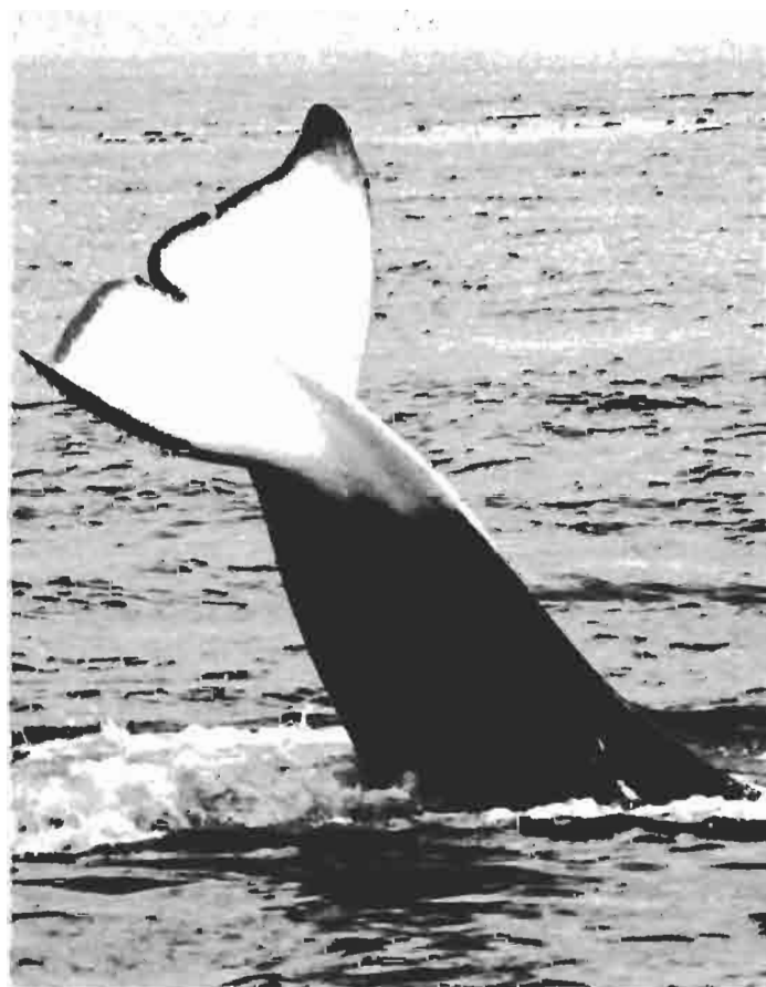
Transient taillobbing on harbor seal in the Oak Bay Islets Ecological Reserve.