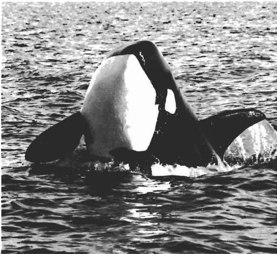
Transient Q7 porpoising.

Transients Q3 and Q7 carrying seal, followed by scavenging gulls in the Oak Bay Islets Ecological Reserve.