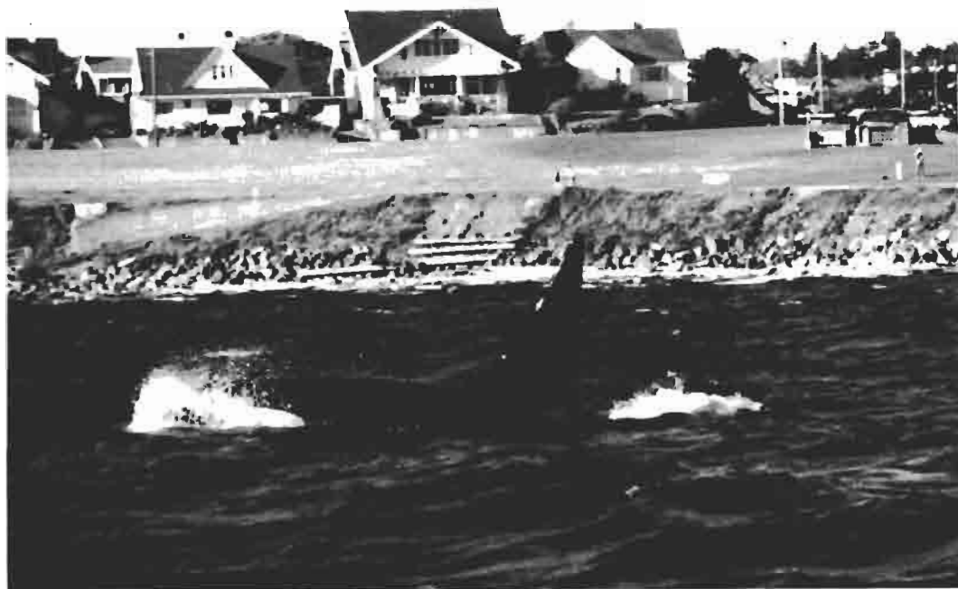
Transient Y1 off the Victoria waterfront.