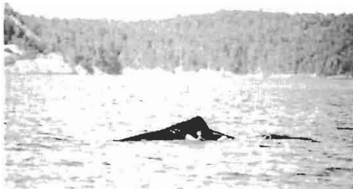
Transient X10 off Race Rocks Ecological Reserve.