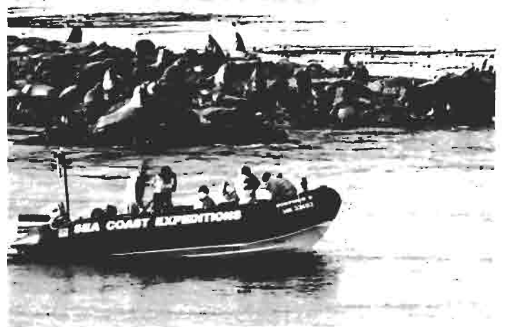
Research vessel, Porpoise II, a 23' MK V1 Rigid-hull Zodiac, with sea lions at the Race Rocks Ecological Reserve.

While transients are generally silent during foraging—presumably to limit detection by their mammalian prey—once the prey is captured we have observed much splashing behavior, as the whales repeatedly taillob, breach, and porpoise onto the prey. With larger prey such as sea lions this might serve to