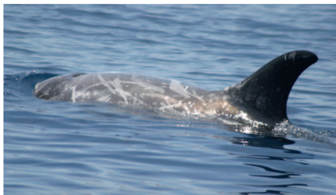
Figure 2 The Risso's dolphin has one of the tallest dorsal fins in relation to body size of any cetacean. Linear scars on Risso's dolphins can often cover the majority of the body surface.

Risso's dolphins are distributed worldwide in temperate and tropical oceans, with an apparent preference for steep shelf-edge habitats between about 400- and 1000-m deep. In the North Pacific they can be found as far north as the Gulf of Alaska and the Kamtchatka Peninsula, in the South Pacific to Tierra del Fuego and New Zealand. In the North Atlantic they have been documented as far north as southern Greenland and southern Norway. They are found throughout the Mediterranean and the Indian Ocean. No worldwide population estimates exist, although a number of regional estimates