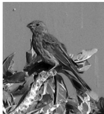
A House Finch photographed on tiny Sand Island, French Frigate Shoals 17 September 2007 required some careful study to identify it, as Asian vagrants have also been recorded in the vicinity.