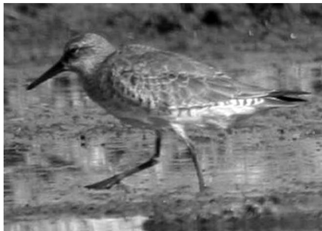
This Red Knot at Ohiapilo 18 October 2007 (here) and later was one of a number of rare shorebirds on Molokai Island, Hawaii this fall.

Gulls were generally scarce through the fall. Single Laughing Gulls were seen at various spots on Oahu and Molokai I Aug+ (m.ob.). A Ring-billed Gull was observed at Kii 27 Oct (MO), and 2 were at Honouliuli 25 Nov (PD). A Franklin's Gull was seen offshore from w. Hawaii I. 13 Aug (ph. RB), and one was observed at Kealia in mid-Aug (MN). Franklin's are regular in the Region late spring–early summer but are quite rare otherwise. Two Common Terns were observed at FFS. 8 Aug–17 Sep, and one continued there through 14 Oct (ph. MB, EC, MM, MY). A Least or Little Tern was found at Kealia 15 Aug (MN), and a subad. Least Tern was seen