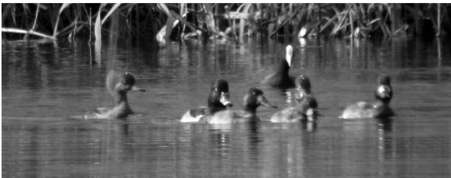
The rarest duck of the fall 2007 season in the Hawaiian Islands region was this female Hooded Merganser photographed at Lokowaka Pond, Hawaii Island 25 November. It was fortunate the bird was photographed that day, as it was never seen again.