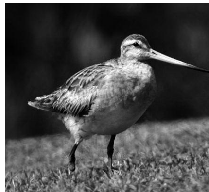
Bar-tailed Godwits are the most common godwits in the Hawaiian Islands region but are still quite uncommon. Few are documented as well as this second-year bird photographed along the Pearl Harbor shoreline 15 October 2007.