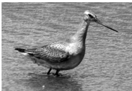
This 22 September 2007 image of a Hudsonian Godwit at Kii, Hawaii shows the slightly upturned bill, very unlike Black-tailed Godwit's straight bill. A few observers were able to see the diagnostic dark underwing coverts that separate Hudsonian from Black-tailed, but none of the photographs of this bird, only the second ever recorded in the Hawaiian Islands region, showed the underwings. Photograph by Peter Donaldson.

Hooded Merganser at Lokowaka Pond, H. seen only 25 Nov (ph. J&AK)