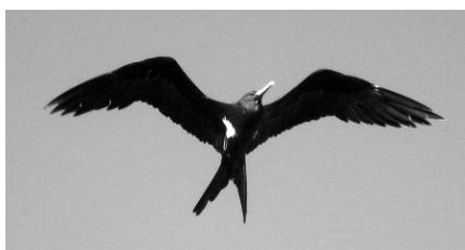
One of two male Lesser Frigatebirds present late October through early November 2007 at French Frigate Shoals, showing the white feathering on the flanks and axillaries that distinguish the males of this species.