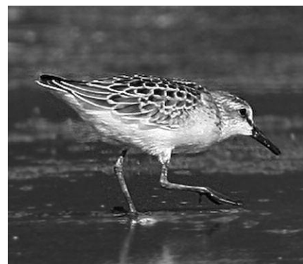
A Semipalmated Sandpiper was nicely photographed 17 August 2007 at Ohiapilo on Molokai Island, Hawaii. Semipalmated Sandpipers are rare in the Region, and very few "peeps" are photographically documented in Hawaii.

As usual, numbers of migrant shorebirds ramped up rapidly in Aug, with a count of 330 Pacific Golden-Plovers at Honouliuli 27 Aug (PD). Pacific Golden-Plover is the most widespread and abundant migrant shorebird in the Region. A Gray-tailed Tattler at Ohiapilo mid—30 Sep (†ADY) was a rare find; the species is seldom reported in the M.H.I., but since Gray-tailed and Wandering Tattlers are so similar, some Gray-taileds may be overlooked. An Actitis sandpiper, either Common or Spotted, was seen on F.F.S. in early Aug (MP). Spotted Sandpiper has been confirmed once previously at F.F.S., whereas other records from the N.H.I. could have pertained to either Spotted or Common Sandpipers, the