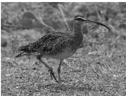
Whimbrels are much less common than Bristle-thighed Curlews in the Hawaiian Islands. This Whimbrel on the southwestern coast of Oahu Island 15 August 2007 was cooperative enough to allow some excellent photographs that show the subtle features that separate the two species. Note the dull brown upperparts with small pale spots and the lack of spiky thigh feathers.

was observed to have a brown rump, so it must have been a North American bird (formerly known as Hudsonian Curlew or Hudsonian Whimbrel) (BJ); another remained at Koheo, Mo. 25 Oct+ (ADY). Whimbrels are much less common in this Region than Bristle-thighed Curlews—unlike almost anywhere else in the world—and there are no previous records from Molokai I. Bristle-thigheds were present in good numbers on Oahu and Molokai I., with a high count of 53 at Kii 20 Oct (RM, PD). Single Ruffs were seen at Kealia 14 Aug (AB) and Kii 19 Sep (MS). A single male Ruff at Ohiapilo 3 Sep was joined by a female Ruff 5 Sep (ph. ADY) and then a 2nd male 11 Nov (ph., ADY). The 3 Ruffs remained in the Ohiapilo area Nov+ (ADY, m.ob.). Ruffs are uncommon in the Region, and there is only one previous record from Molokai.