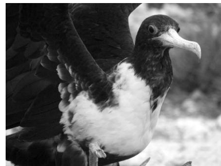
This female Lesser Frigatebird (here 25 October 2007) at French Frigate Shoals was later joined by two males. Although not as distinctive as the males, this photograph shows the diagnostic black throat and white axillaries that separate Lesser females from other frigatebirds.

at Kealia through at least 2 Nov (MN, CP); this is the first record for a summering bird in Hawaii. We received an unusual number of Brant reports, including one of 6 at Kamalo, Mo. 9 Nov (ADY), a single bird at Kihei, M. 20 Nov (RY), 3 at Ohiapilo, one at Kamalo, Mo. 25 Nov (ADY), 2 at Kihei, M. 26 Nov (AV), and 4 at the Salt Pond in Hanapepe, K. 29 Nov (JD). Lingering migrant ducks included a Gadwall at Waiakea Pond 10 Nov (DL) and an American Wigeon at Kaunani, Mo. through at least 21 Sep (ADY). New migrant ducks started to arrive in late Se but in low numbers. The high count for Northern Shovelers was 79 at Kii 24 Nov (PD) and for Northern Pintail only 43 at Kii 13 Oct (PD). The highest count of bay ducks was a flock of 3 Ring-necked Ducks and 13 Lesser Scaup at Kualapuu Res., Mo. 6 Nov (ADY). Two Canvasbacks were observed at Kii 10 Oct+ (MO,